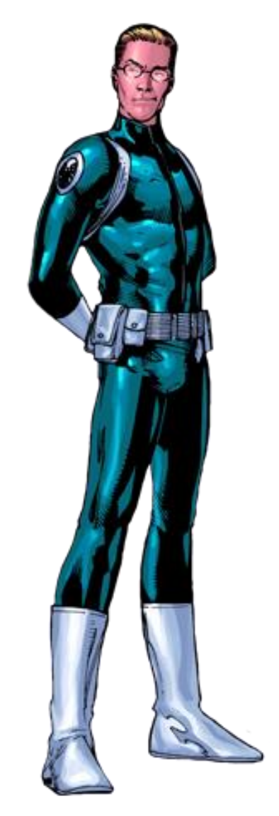
Agent Sitwell, pre-zombie

(See GHotMU Vol 6 for his pre-zombie stats).