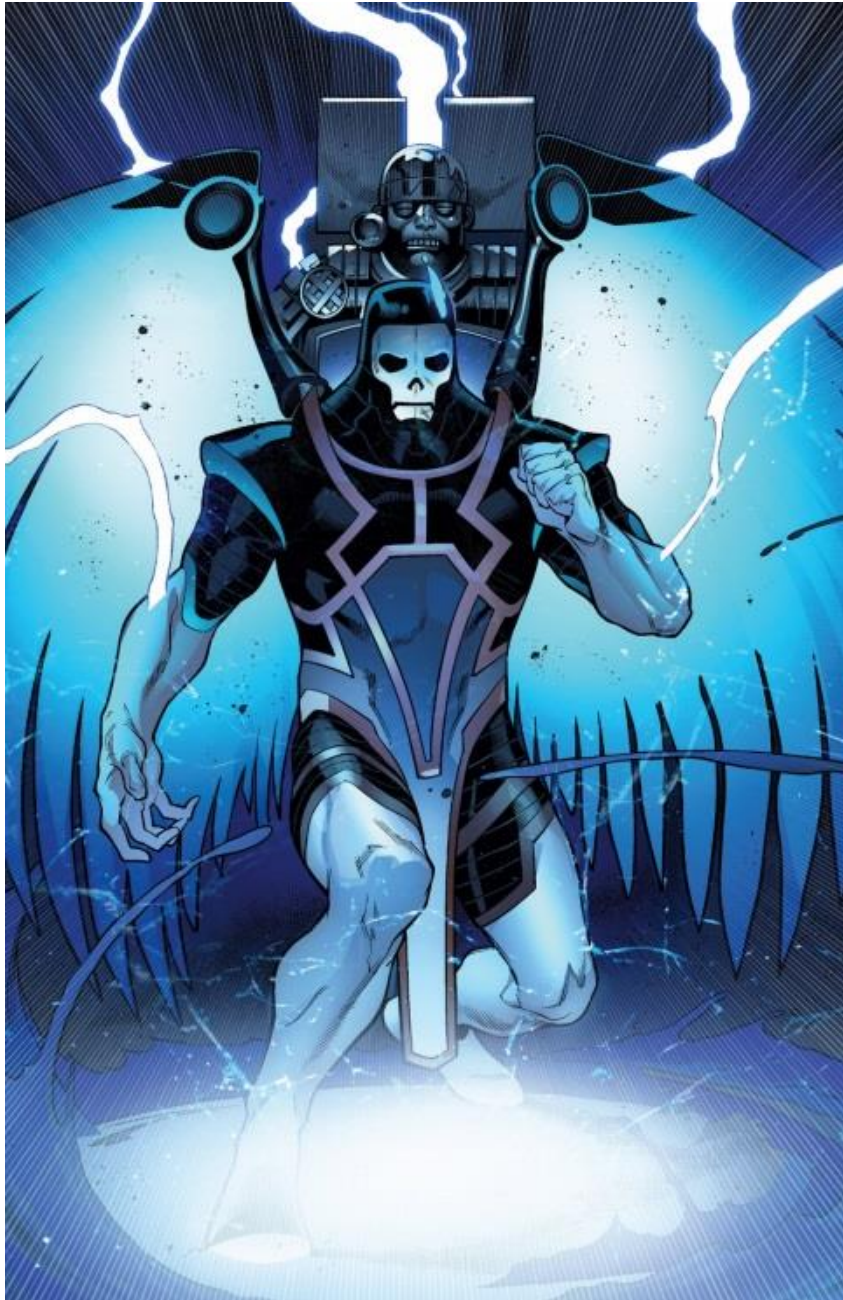
Angel's Cosmically-Enhanced Form

do with such a powerful item. The heroes were tracked down by Mister Knife's cosmically-empowered Slaughter Lords and overpowered. Gamora, Beast, and Angel submitted to the Black Vortex in order to face the Slaughter Lords, and began to attempt to empower the entire universe. After coming into conflict with the Accuser Corps, the heroes were convinced by Magik and Rocket Raccoon to fight J'son, and help save Spartax. Before getting rid of the Vortex, some of the cosmically empowered heroes decided to remove their cosmic powers, but Angel was not one of them.