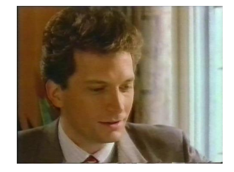
Daredevil (Earth-400005) Matthew (Matt) Murdock