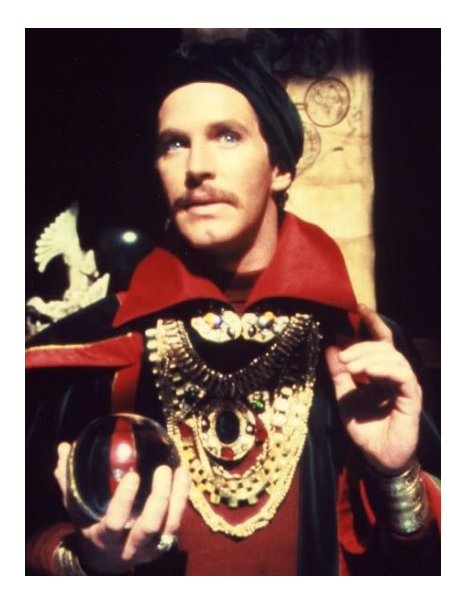
Doctor Strange (Earth-96173) Stephen Strange